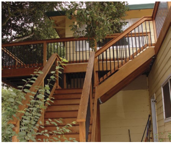
A recent outdoor construction project by JD Building

For complete rating and research information on this company, go to: www.diamondcertified.org/report/jd-building